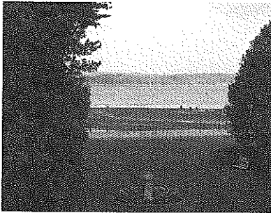
Rear of The Grove