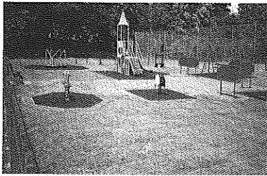
Noads Way Play Area